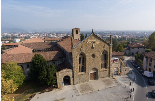
Sant'Agostino Conference Room Via Fara, 24129 Bergamo