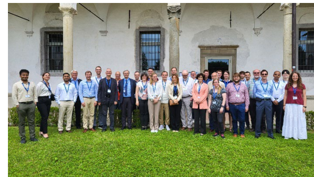
DIPSI Workshop 2024, Bergamo 17 th June 2024

https://aisberg.unibg.it/handle/10446/73205