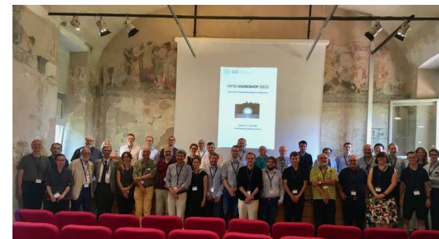
DIPSI Workshop 2022, Bergamo 1 st July 2022

The Book of Proceedings of the last edition of the DIPSI Workshop is available at: https://aisberg.unibg.it/handle/10446/234208