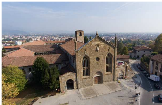
Sant'Agostino Conference Room Via Fara, 24129 Bergamo